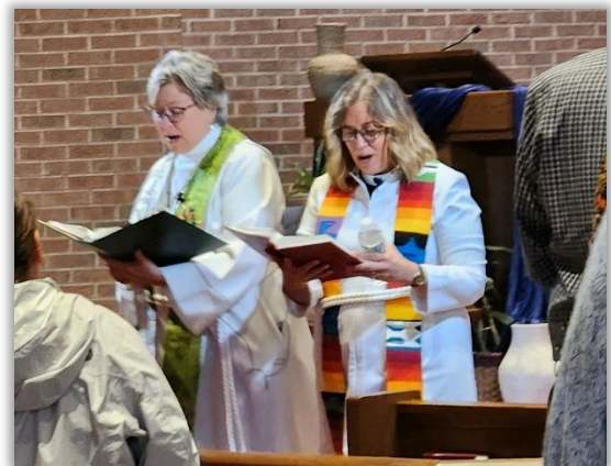
House Next Door Sunday