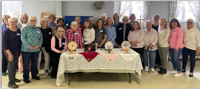
Seasons of Life Retreat with the Women of Holy Trinity, Red Bank