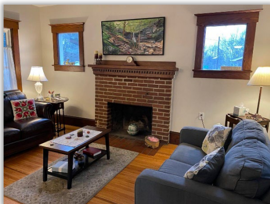
Welcome. Respite. Peace.