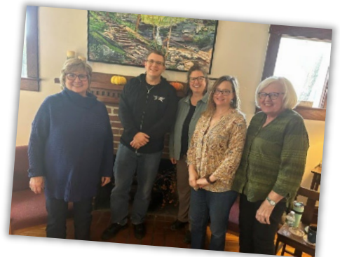
Day of Respite for Rostered Leaders