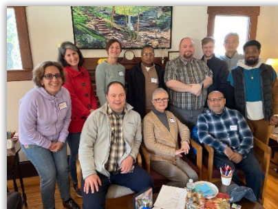
Retreat for the chaplains of Robert Wood Johnson Hospital