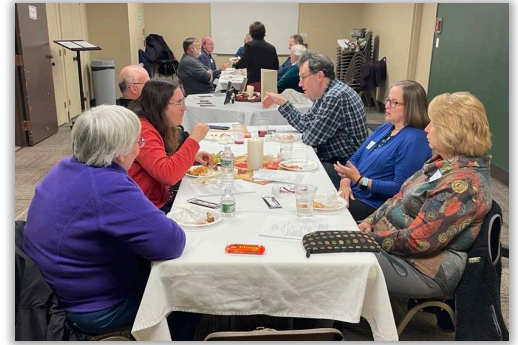
All Saints Dinner Church