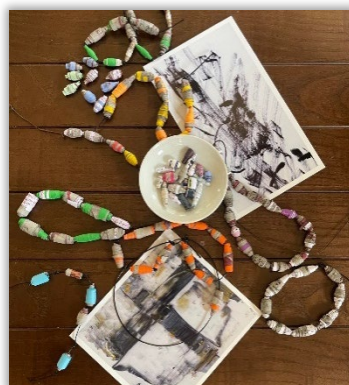
Art.full Prayer with Pat Pickards

"The perfect day to say, I just LOVE this place of hospitality and sacred presence – simply abundant with artful inspiration and invitation!