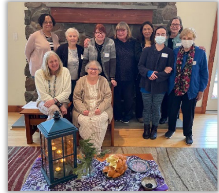
Ash Wednesday Retreat at Cross Roads

Holy Trinity Lutheran Church Women's Retreat @ Red Bank