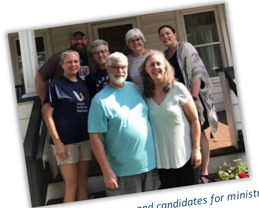
Gathering of seminarians and candidates for ministry