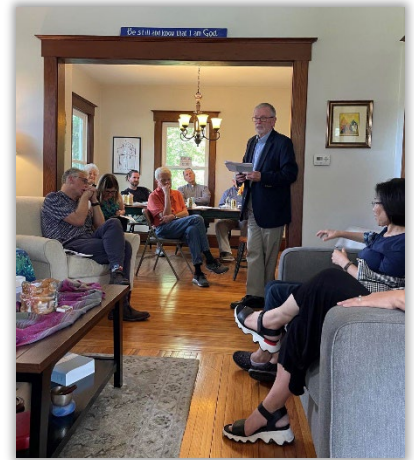
Welcoming WHAM (Windsor Hightstown Area Ministerium)